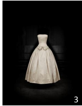
12 : Le jardin d'hiver